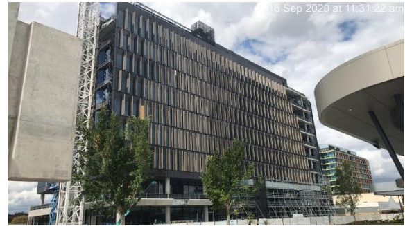
Administration building facade