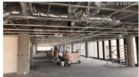
L: Children's library exterior R: internal fitout in administration building