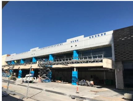
Refurbishment of EATS building