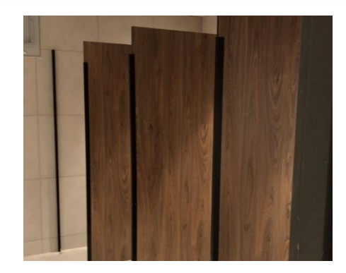
Toilet partitions in the amenities