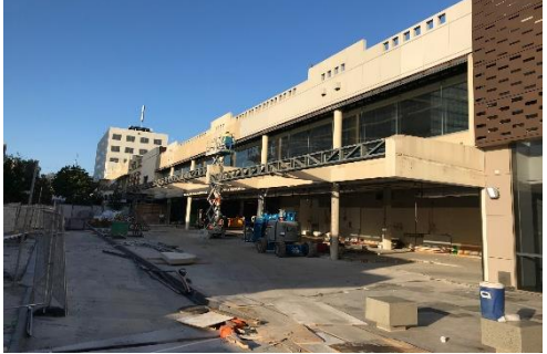
Pouring of footings