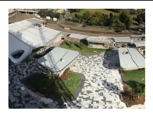
General Library and Civic Plaza