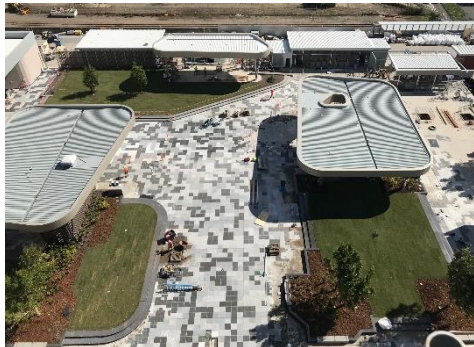
Birdseye view to Civic Plaza